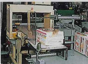
● Paper processing