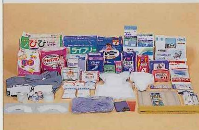
● Synthetic (non-woven) fabrics