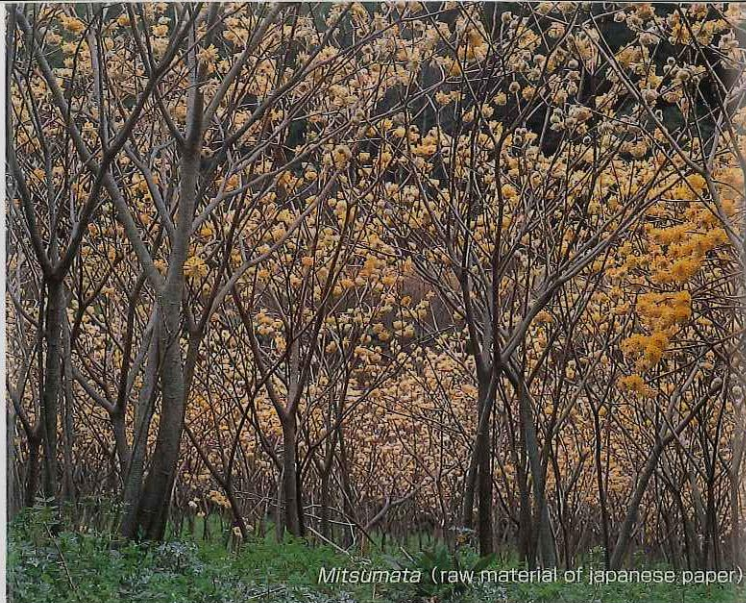
Mitsumata (raw material of Japanese paper)

Held on the last weekend in July each year, the Shikokuchuo Paper Festival is the biggest event in the social calendar of the Kawano district of Shikokuchuo City. It features exhibitions and markets, and the "Paper Dance" throughout the city center. Come and party with us!