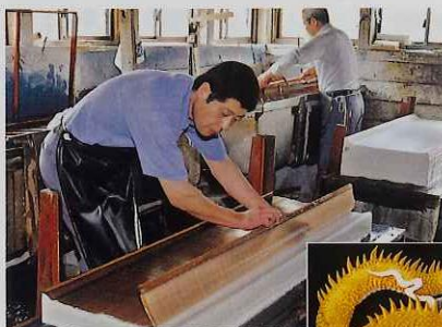
● Making paper by hand

A diverse range of products is manufactured here, from traditional paper to synthetic fabrics to machine made paper goods. On a national level, Shikokuchuo City is highly regarded as one of the leading producers of mizuhiki (decorative paper twine).