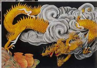
● Mizuhiki craft