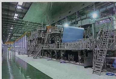
● Paper factory